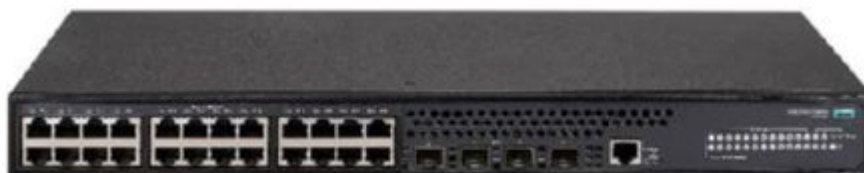
HPE Networking Comware 5140 24G 4SFP+ EI Switch (JL828A)