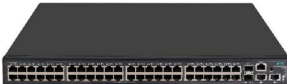
HPE Networking Comware 5140 48G PoE+ 4SFP+ EI Switch (JL824A)