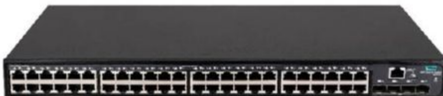
HPE Networking Comware 5140 48G 4SFP+ EI Switch (JL829A)